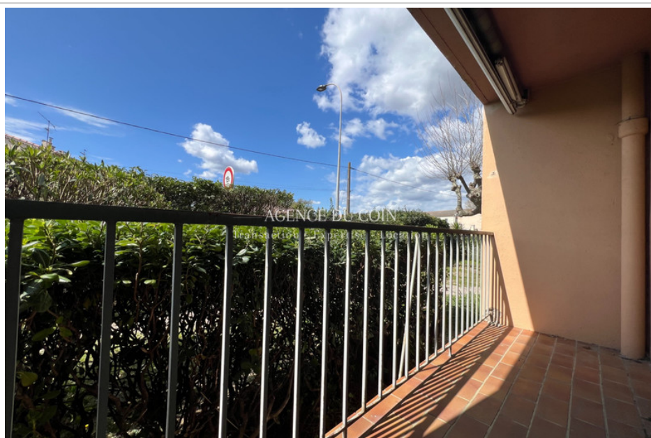
Apartment Le Muy